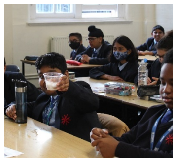
Year 7 students looked at sustainable food and the importance of 'growing your own'.

We held our first Eco Day of the term this week. The theme was "Sustainable Food", and we looked at how far our food travels, how much food we waste, and how we can shop more sustainably. All lessons were taught without projectors and computers to see how much energy we could save on a particular day.